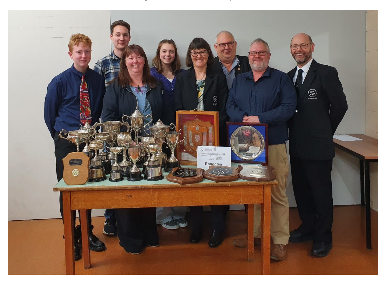
Rongotea - MSRA Windup 2022

We lose four members to the South Island and one to England. Our membership dips again.