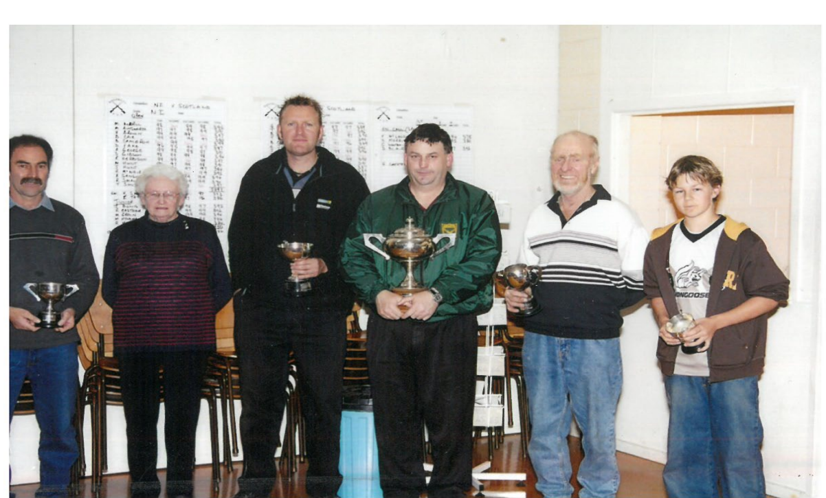
Club Champions 2005

In 2004, rather than lose the history of the Palmerston North Club trophies, it was decided to recycle the trophies and use them for the 20 shot Club Champions in each grade.